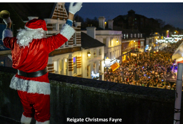
Reigate Christmas Fayre